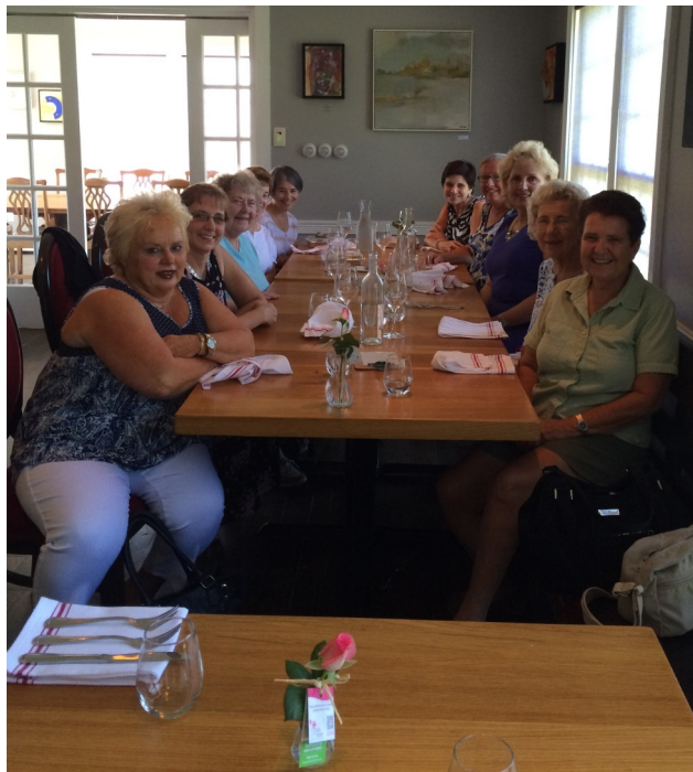
Zeta Chapter members enjoying a day at Chamard Winery and Bistro