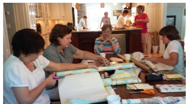
Mu Chapter members working on Books for Babies project