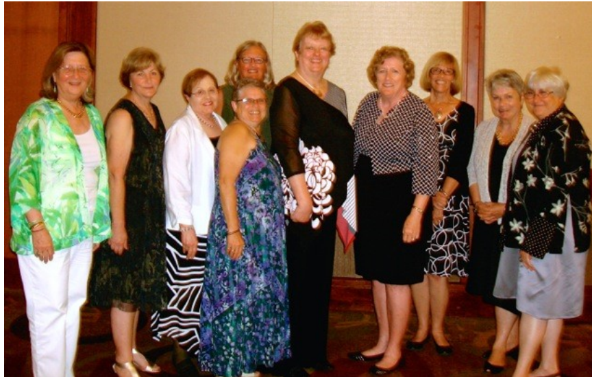
AKS members at Presidents' Dinner