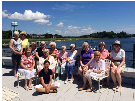
Iota members enjoying the beautiful day in Stonington, as they plan for the coming year.